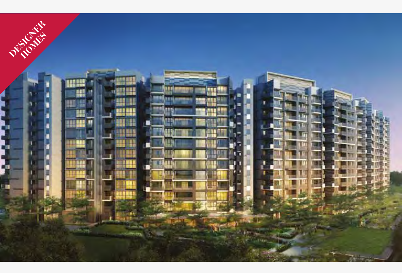
Artist's Impression Concept Designer: Mr Chan Heng Fai Architects: AGA Architects Pte Ltd

"SingXpress embarked on this venture with success as we won the bid at approximately $$123.9 million for a DBSS project presently being developed on a 16,388.2 sqm site in Pasir Ris Central with a maximum permissible Gross Floor Area (GFA) of 40,970.5 sqm (2.5 times plot ratio), targeted to comprise 447 apartments. The development is a 4 residential block, 13/14 storey DBSS project with 3R, 4R, and 5R unit types inclusive of a child care centre, car park, and all facilities ancillary to the development."