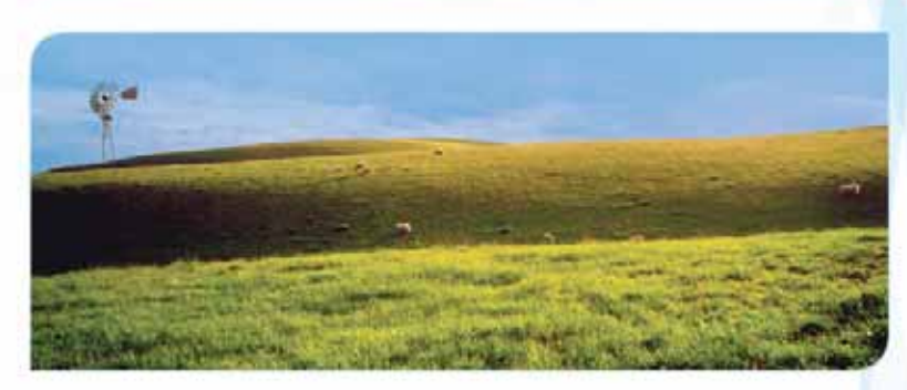
COLLTECH AUSTRALIA LTD J ANNUAL REPORT