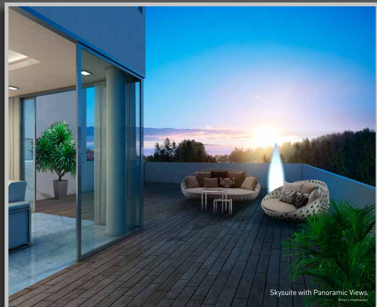
Skysuite with Panoramic Views Artist's Impression