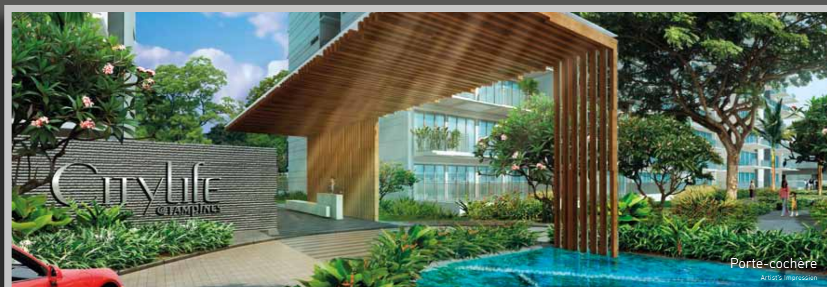
Porte-cochère Artist's Impression