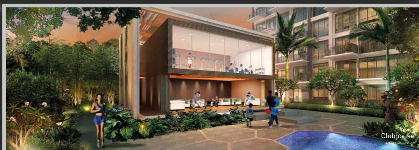
Clubhouse Artist's Impression